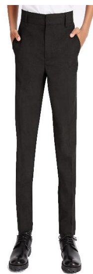
Slim Fit Trousers