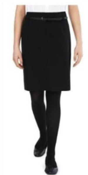
Knee Length Pencil Skirt