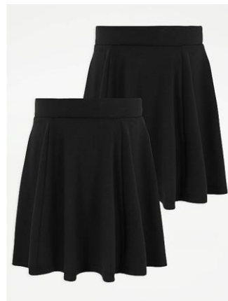
Skater Style Skirts