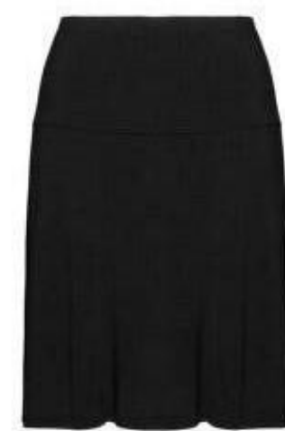
Knee Length Pleated Skirt