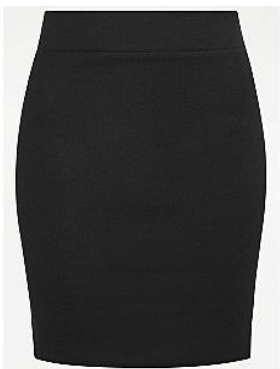
Lycra/Tube Style Skirts