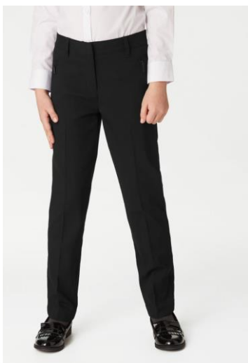
Straight Legged Trousers