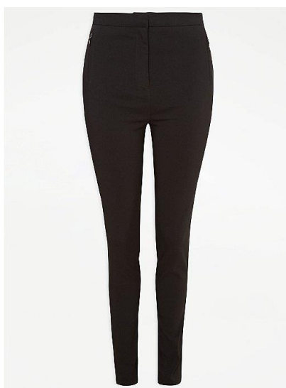
Skinny Fit Trousers