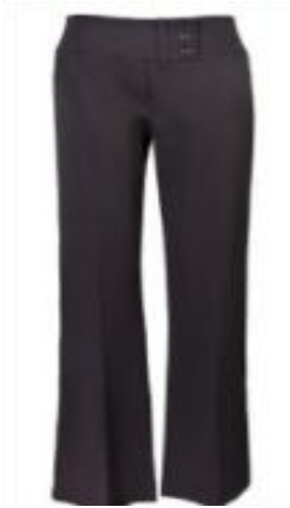
Boot Legged Trousers