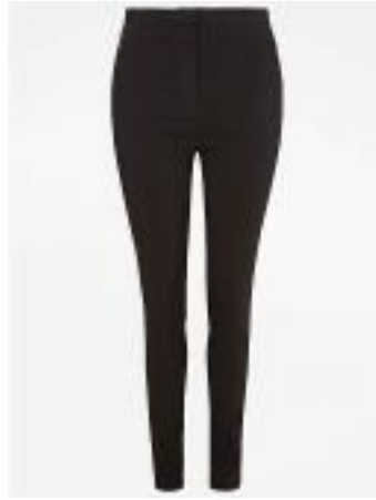
Skinny Fit Trousers