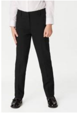
Straight Legged Trousers