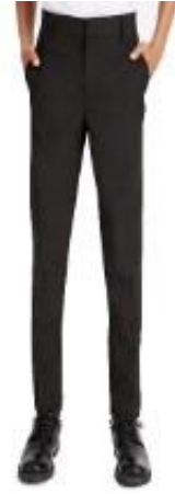
Slim Fit Trousers