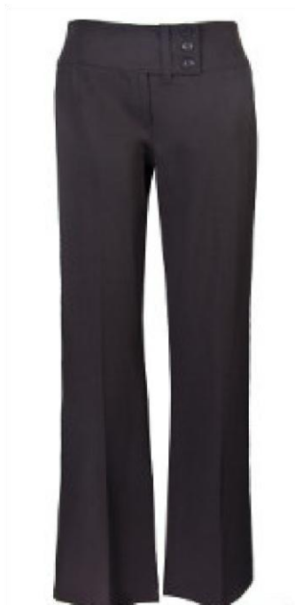
Boot Legged Trousers