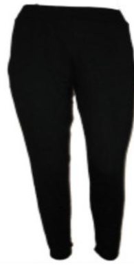
Harem/ Baggy Trousers