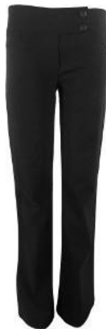
Straight Legged Trousers