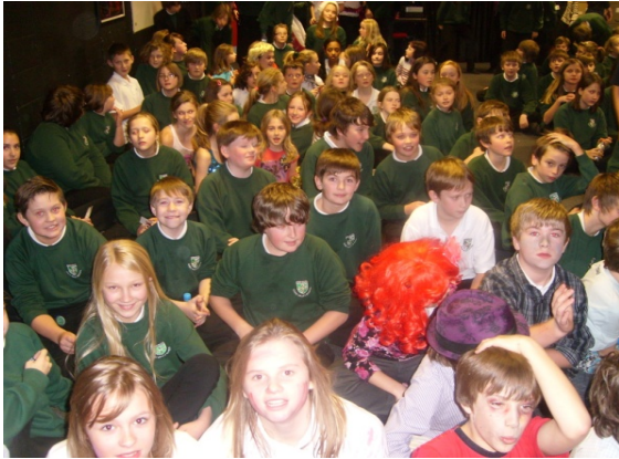
The Year 7 audience await!

Tutors have been stepping up the pressure on their tutees in the last few weeks to try to bag the much coveted 'Termly Tutor Trophy' award. On December 7 th , the year group were treated to a dazzling array of talent in 'Chew's Got Talent'.